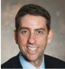
CAMERON DICK MP Minister for Education and Industrial Relations