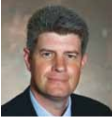
STIRLING HINCHLIFFE MP Minister for Employment, Skills and Mining